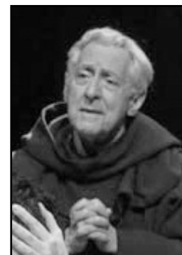
Father Lawrence, from a production by the Chicago Shakespeare Company