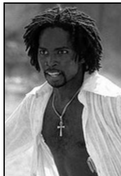
Mercutio, from the 1996 film