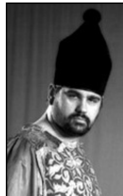
Prince Escalus, from an opera production