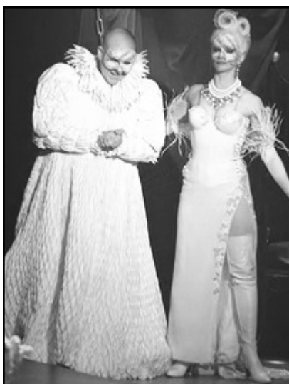
Lord and Lady Capulet, from a German musical production