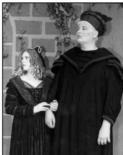
Lady and Lord Montague, from a production by the California School for the Deaf