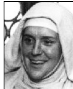
Nurse, from the 1968 film